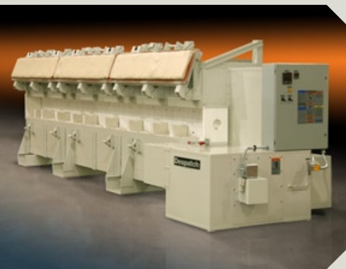
Non-magnetic, non-metallic option