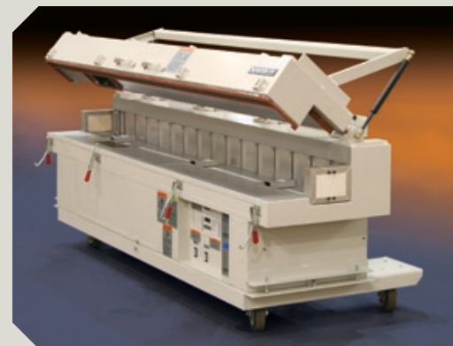
Front loading option