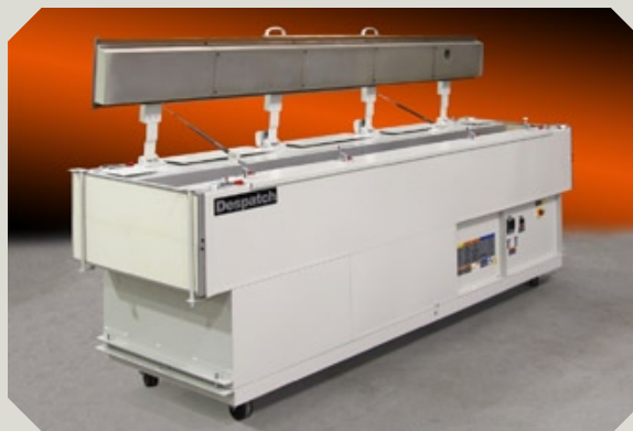
Top loading, gas cylinder door lift assist option